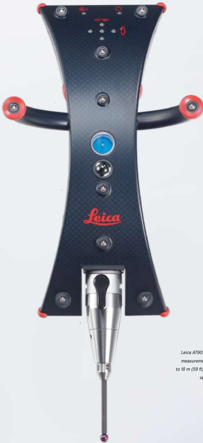
Leica AT901-MR gives you a measurement volume of up to 18 m (59 ft), Leica AT901-LR up to 30 m (98 ft)

User-friendly, fast and accurate, Portable CMM from Leica Geosystems allows you to assemble aircraft faster and inspect automotive parts more efficiently while minimizing digitization times and costs. If you want the whole picture, go portable CMM. A laser tracker is just the beginning.